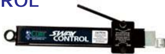
CT17200 Curt Passenger side