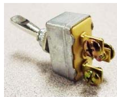
PK34-225 black handle on-on 2 position 3 screw terminal