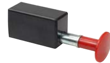
PK52-261 2 POS. AXLE SHIFT SWITCH