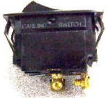
PK34-301 Rocker Switch