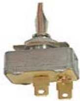
PK34-218V mom on-off-on 3 positions 3 screw terminal