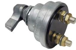
PK51-902P MASTER DISCONNECT SWITCH