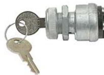
PK31-601 Non Start 3 position acc-off-ign keyed alike