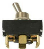
PK34-574P Toggle Switch