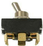
PK34-579 Toggle Switch On-Mom Off