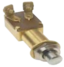
PK33-200 HD Momentary Start Switch