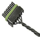
PK42-203P Weatherproof Connector for Fuel Selector PK42-159P