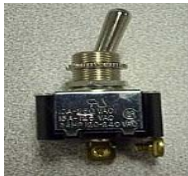
PK34-571P on-off 2 position 2 screw terminal