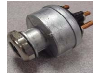
PK31-159 Momentary start switch 4 position acc-off-ign-start