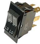
PK34-312 high-off-low 3 position 6 blade terminal dual black act . bezel