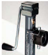
500105 1 & 5K 6.50" Radius 500171 7K 8.50" Radius