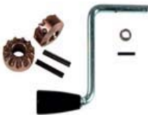
500256 2K 5.80" Radius