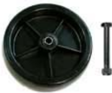
6811S00 - Replacement Caster