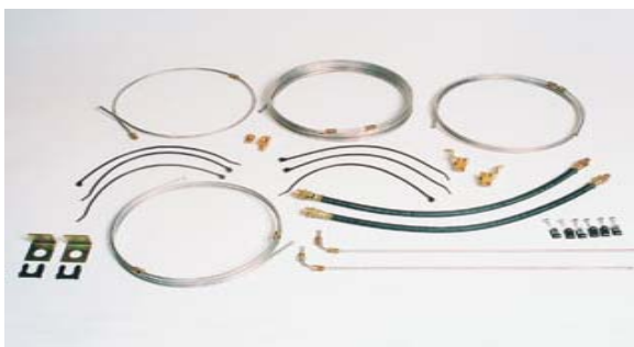
(AG-200TA—Tandem Axle Kit pictured above)

Q-13SA Quick Disconnect Tongue Kit (for trailers with a removable tongue)