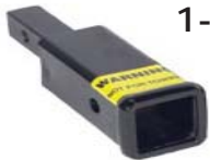
1-1/4" TO 2"

CT45785 HITCH ADAPTER INCREASES YOUR RECEIVER OPENING FROM 1 1/4" TO 2" 6-1/4" EXT GREAT FOR BIKE RACK APPLICATIONS NOT TO BE USED FOR TOWING TO BE USED WITH CLASS II HITCHES