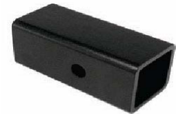
2-1/2" TO 2"

CT45770 REDUCER SLEEVE 2" TO 1-1/4" 4" EXT RECEIVER TUBE REDUCER