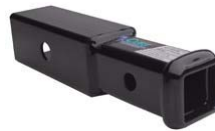
2" TO 1-1/4"

CT45785 HITCH ADAPTER INCREASES YOUR RECEIVER OPENING FROM 1 1/4" TO 2" 6-1/4" EXT GREAT FOR BIKE RACK APPLICATIONS NOT TO BE USED FOR TOWING TO BE USED WITH CLASS II HITCHES