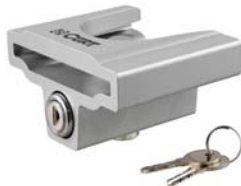
CURT COUPLER LOCK CT23079 Fits 1 7/8" & 2"