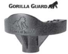
Gorilla Guard Trailer Lock TP17 - 1 7/8" coupler 63228 - 2" coupler TP25 - 2 5/16" coupler