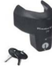
39AT Hammerblow Coupler Lock