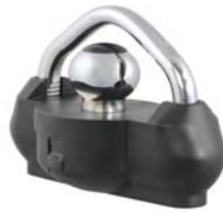
CURT COUPLER LOCK CT23179 Fits 1 7/8", 2" & 2 5/16" Couplers