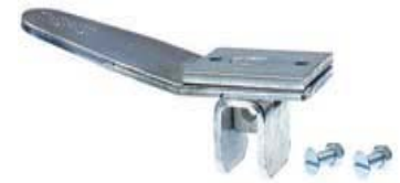
DL6298 - Hitch Lock, Trailer Guard