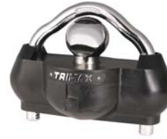
TRIMAX COUPLER LOCK UMAX100 Fits 1 7/8", 2" & 2 5/16" Couplers