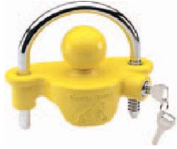
FULTON COUPLER LOCK 63226 YELLOW Fits 1 7/8", 2" & 2 5/16" Couplers