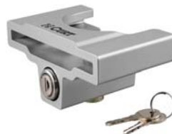
CURT COUPLER LOCK CT23081 Fits 2" & 2 5/16"