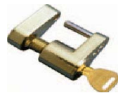
BCL500 - Coupler Lock