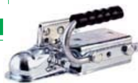
DL6295 - Coupler Handle