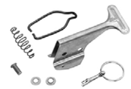
024200 Kit W/Spring