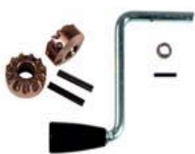
500256 2K 5.80" Radius