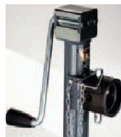
500105 1 & 5K 6.50" Radius 500171 7K 8.50" Radius